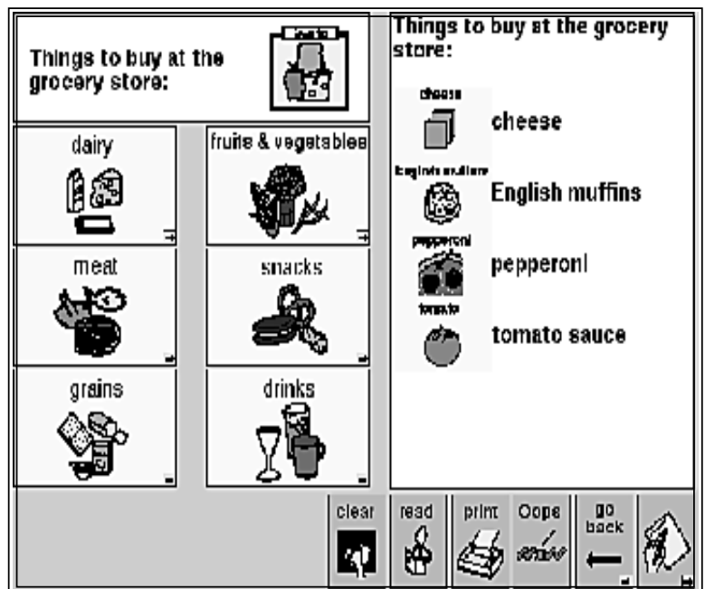
Figure 1: Screen shot of “Grocery List” (words and pictures) from Writing Activities.

This article originally appeared in the June/July, 2001 issue of Closing The Gap .